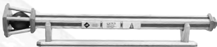
Oakland Community College Mace